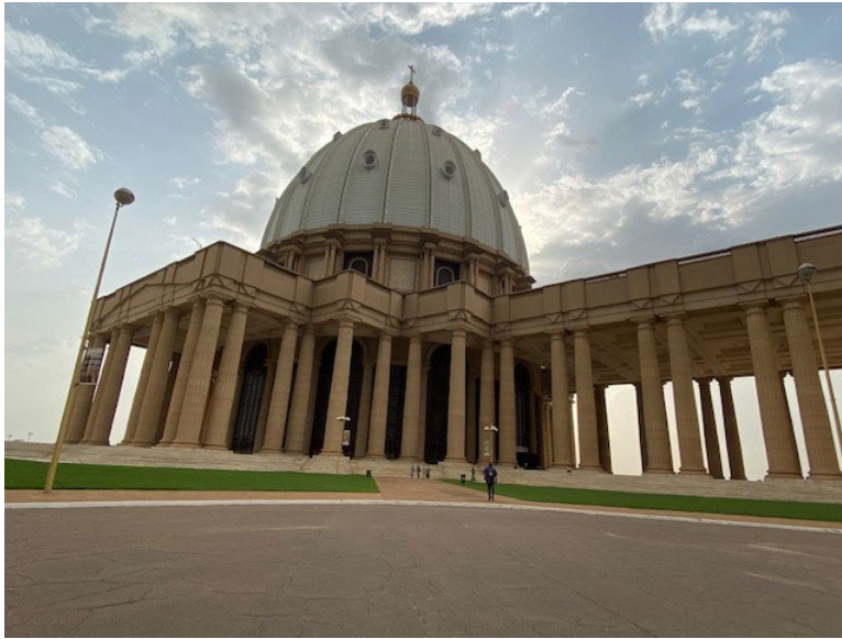
Figure 5: View of the Basilica of Our Lady of Peace.

and successive steps of the project were decided and programmed together, according to the wishes and suggestions of all the members.