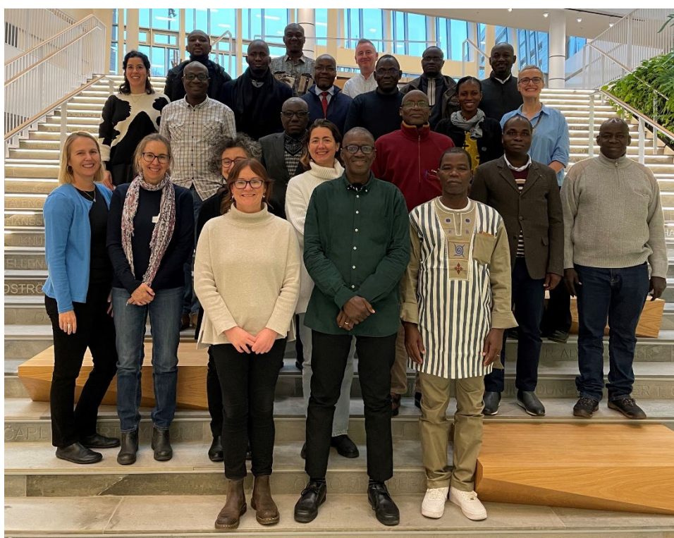
Figure 1: The participants to the PEP kick-off meeting in Uppsala.

The structure of the meeting included different moments with different tasks and goals. The first day gave the opportunity to get to know each other, we learned more in detail about the PEP project on the second day and planned the PEP project on the third day. The last day was dedicated to summarizing and to looking forward. We also got the opportunity to have our first Steering Committee meeting, and the Design Thinking workshop. On the last day, we also conducted an evaluation, where we asked our partners what they thought of the meeting. We got a very positive response, which fully corresponds with our feelings as organizers.