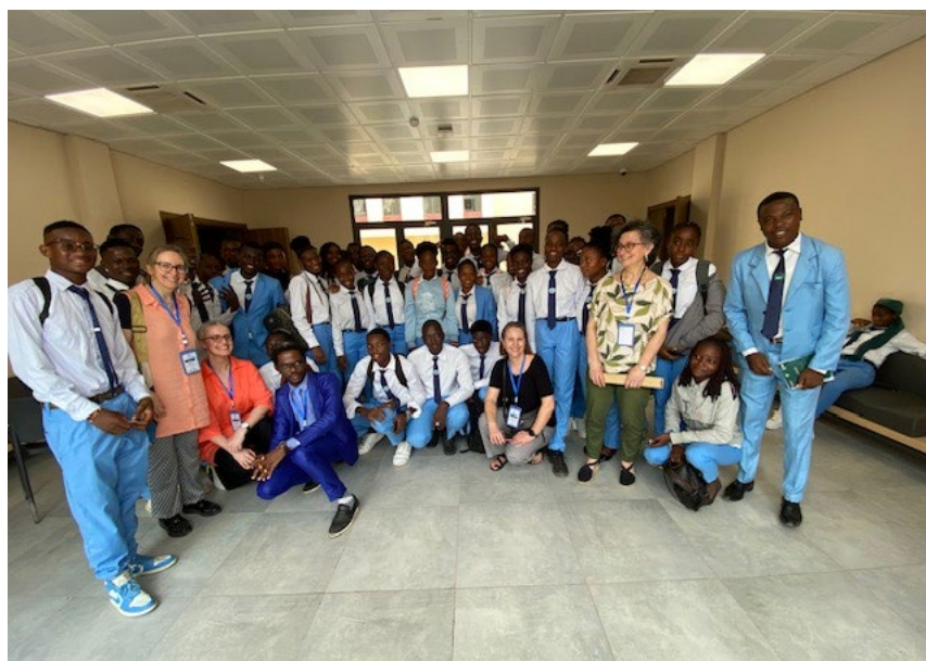
Figure 3: Meeting the students at University of San Pedro.

During the PEP meeting, the colleagues at USP also organized a Language Day when the PEP partners